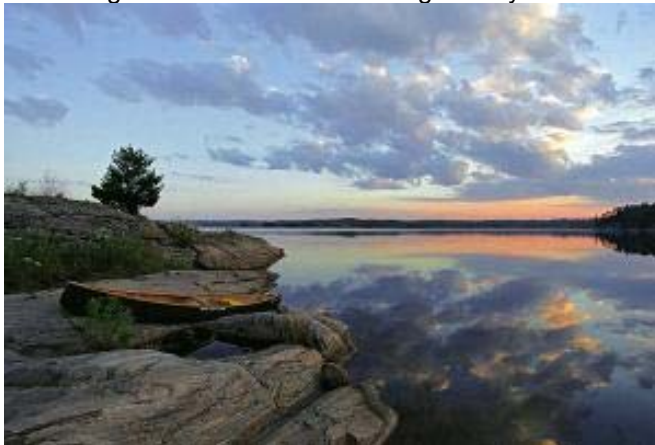
The 135 interior campsites in Massasauga Provincial Park can only be reached by water

The natural environment and the pristine beauty of the Georgian Bay shoreline are essential elements that draw visitors to the Township. Massasauga Provincial Park, located within the Township, stretches from the town of Parry Sound south to the Moon River. The park has an area of over 50 square miles and encompasses hundreds of islands on the coast of Georgian Bay, as well as many inland lakes including Clear Lake and Spider Lake. Classified as a "Natural Environment" park, it contains no roads, so camping is limited to interior sites. The campsites on the bay can be reached by motor boat whereas those on the lakes are typically reached by non-motorized craft such as canoes or kayaks. The park also has mooring anchors for boats to overnight in some inlets on Georgian Bay.