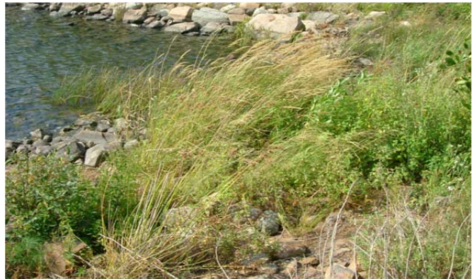
The Township of The Archipelago is actively engaged in encouraging proper stewardship of shoreline areas

The Township of The Archipelago is somewhat unique in that it has two distinct sections that are geographically separated, with the Town of Parry Sound, the Township of Carling and Wasauksing First Nation lying between them. On January 1, 1980, the townships of Georgian Bay South Archipelago and Georgian Bay North Archipelago were formed out of unincorporated geographic townships from the Parry Sound District, primarily in order to provide proper planning in the islands and waterways of the area. The Township of The Archipelago was formed on April 1, 1980, when the townships of Georgian Bay South Archipelago and Georgian Bay North Archipelago merged.