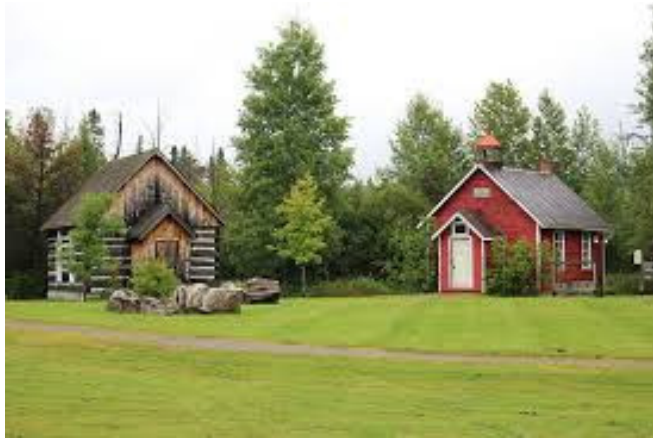
The Minden Hills Cultural Centre is owned and operated by the Township of Minden Hills and features local heritage buildings that have been relocated to the site, buildings containing art and literary exhibits, and the local branch of the Haliburton County Public Library.

Besides having some of the loveliest natural country in the province, the Township of Minden Hills is home to the Minden Hills Cultural Centre. Located in the town of Minden, the Centre features exhibits of local history, art and literature. The Dahl Forest, in the former Township of Snowdon, is a 500 acre nature reserve now maintained by the Haliburton Highlands Land Trust. The public can visit for 'silent' activities such as hiking, cross-country skiing, snowshoeing and birding. For those looking for less silent pursuits, there is a go cart track located just south of Minden. On the way by visitors can stop at the famous Kawartha Dairy bar on Hwy. #35 at Minden and enjoy an ice cream treat made with fresh local milk.