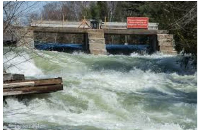
The Minden Wild Water Preserve on the Gull River is considered one of the best whitewater canoe/kayak slalom runs in the world.

The Township of Minden Hills has long been a destination for cottagers and for those who enjoy the outdoors in all seasons. The combination of rolling countryside and numerous lakes made it one of the earliest areas to be developed with cottages. The Gull River flows through the town of Minden (which was originally named "Gull River") and provided a historical route for early lumbermen to deliver their wares to sawmills downstream. Today, the river is a destination for a different kind of adventurer – white water canoeists and kayakers. The Minden Wild Water Preserve attracts enthusiasts from all over the world. This July, it will host the whitewater canoe/kayak slalom competition for the Toronto 2015 Pan Am Games.